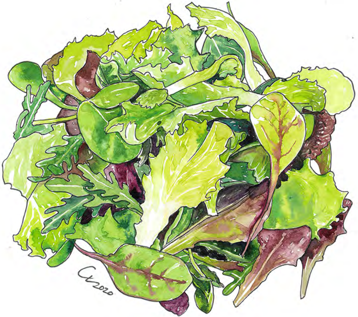
6. Green II by Carlos Cui Watercolour framed $300