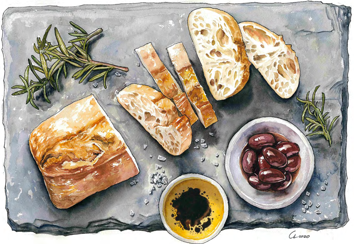
8. Rosemary by Carlos Cui Watercolour framed $500