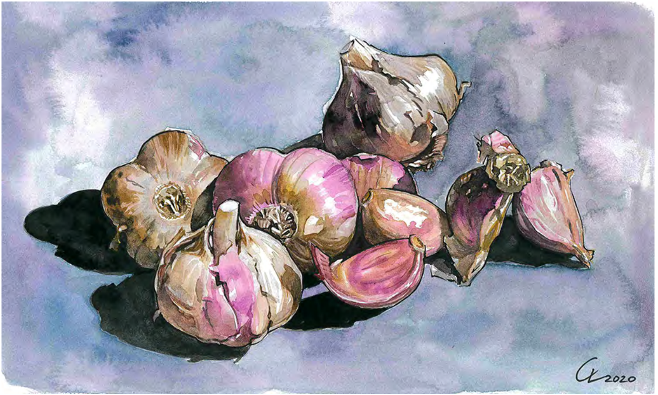
2.Purple by Carlos Cui Watercolour framed $320 SOLD