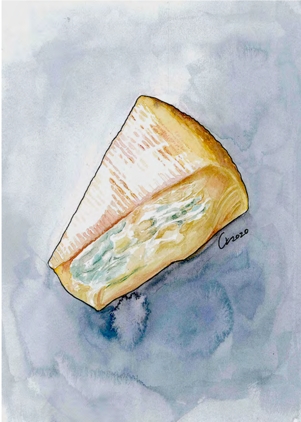
7. Blue Camembert by Carlos Cui Watercolour framed $300