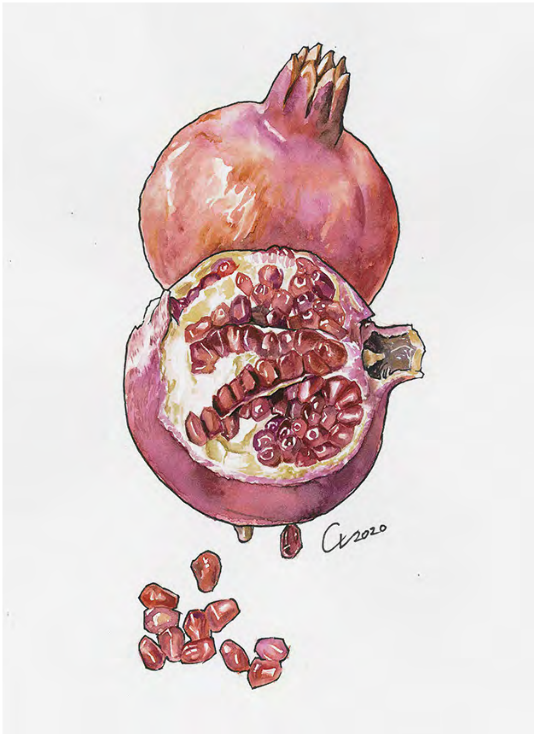
11.Pomegranate by Carlos Cui Watercolour framed $300